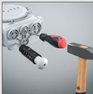
Multi-conduit entries up to M40 and cable entries.