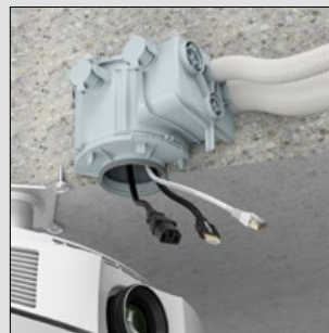
Optimal for multimedial applications through multiple conduit entries up to M40.