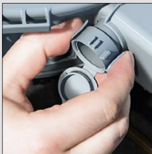
4 M20/M25 combination entries with toolless opening technology.