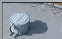
HaloX® for retrofitting