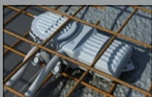
HaloX® for on-site mixed concrete