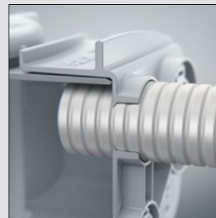
Integrated conduit retention.