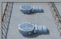
HaloX® for precast concrete