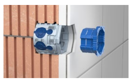
The stepless plaster compensation frame (Art. No. 1155-65) is used to compensate for deep-seated boxes.