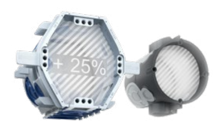
All UP<sup>1</sup> one-gang boxes offer generous installation space for the convenient accommodation of leads, connection terminals and installation accessories.